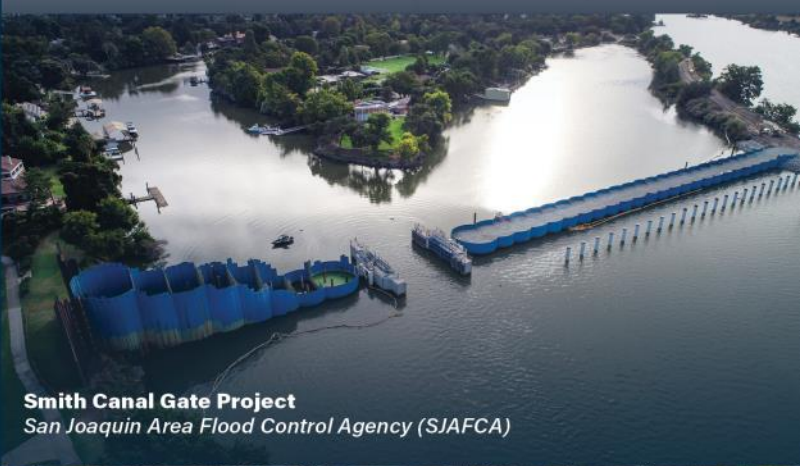
Smith Canal Gate Project San Joaquin Area Flood Control Agency (SJAFC)