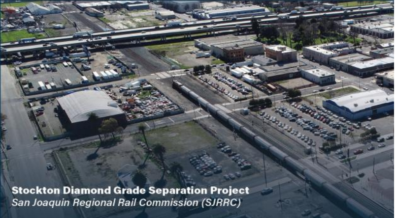
Stockton Diamond Grade Separation Project San Joaquin Regional Rail Commission (SJRR)