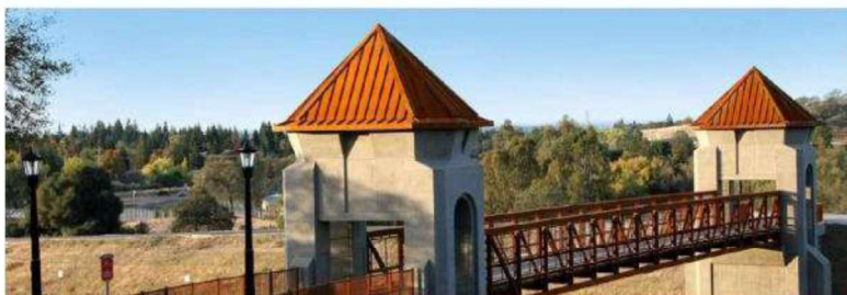
JOHNNY CASH TRAIL & PEDESTRIAN OVERCROSSING FOLSOM, CA