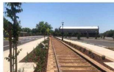
RAILROAD STREET IMPROVEMENTS ELK GROVE, CA