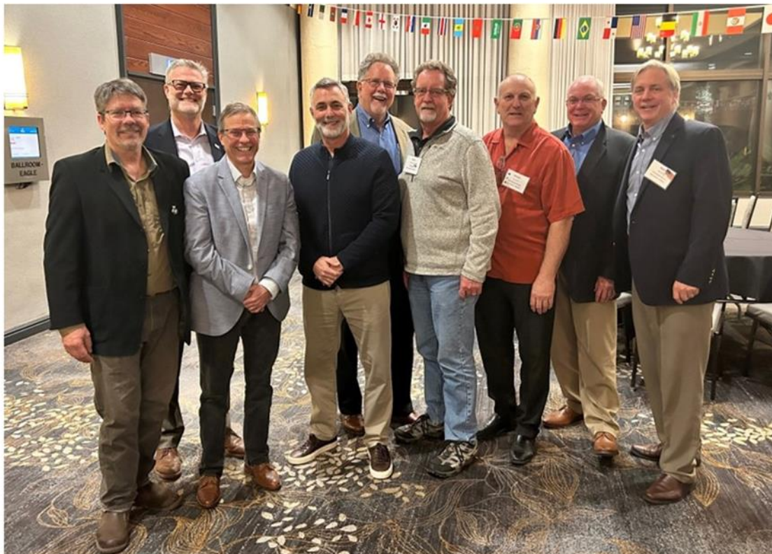
2023 Sierra Chapter Past President's Dinner, February 8, 2023