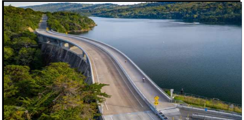
Crystal Springs Dam Bridge

AECOM is the world's trusted infrastructure consulting firm, delivering professional services throughout the project lifecycle – from planning, design and engineering to