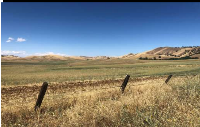
Proposed Location Sites - Main Reservoir

program and construction management, even financing and operations. Locally, in Sacramento and across California, we have more than 100 years of experience through our legacy company's delivering transportation, buildings, water, energy and environment infrastructure projects for public- and private-sector clients. Our planners, designers, engineers, consultants and program and construction managers, are driven by a common purpose, to deliver a better world