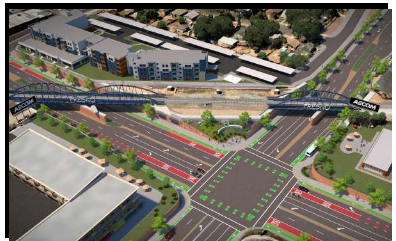
Blackstone McKinley Grade Separation