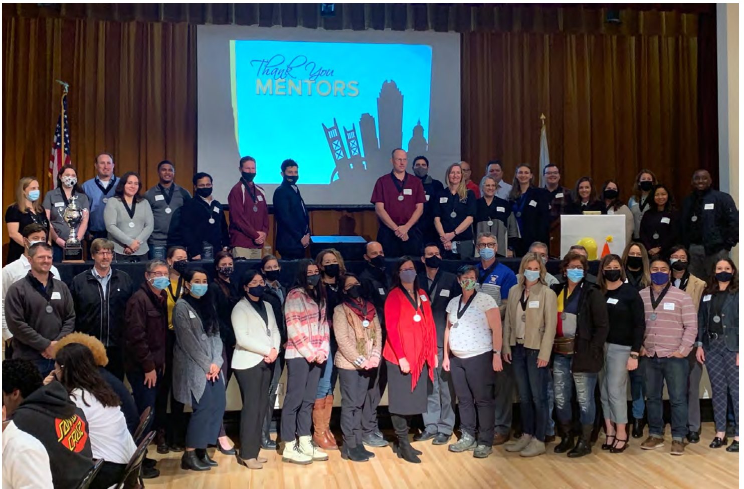
The Fall 2021 CREATE Mentors receive appreciation medals at the Awards Luncheon