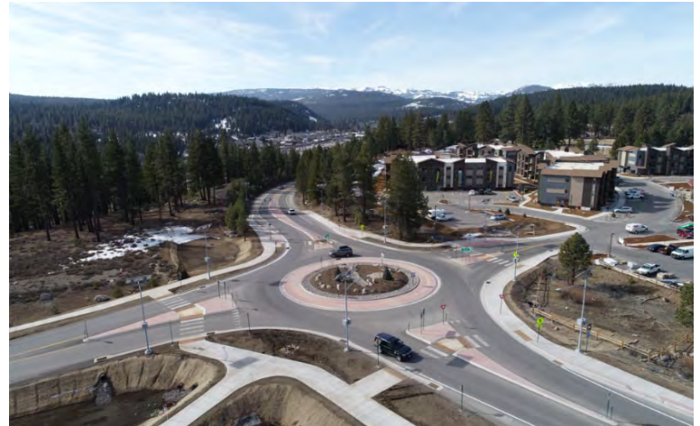
Stockrest Springs Rd. Roundabout, Truckee, CA

As an employee-owned company, we are committed to the role we play in communities where we live, work, and play. Our Sierra region offices are home to forward-looking professionals within all five of our market sectors. Our team provides imaginative thinking and innovative designs to solve our clients' challenges during any phase of the project delivery cycle, from conception and analysis through to construction and permitting.