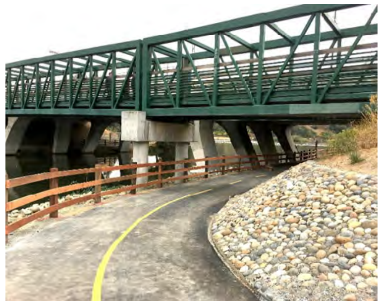
Guadalupe River Parkway, San Jose

GHD ranks #10 in international design firms operating in the US, according to Engineering News-Record . These rankings reflect the size and significance of our sustained and growing business in the US. In addition to the delivery of extraordinary social and economic outcomes, we are focused on building lasting relationships with our partners and clients.