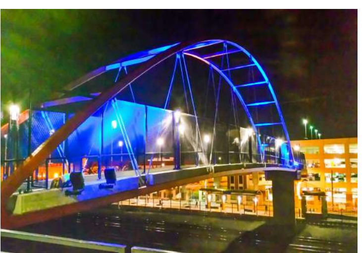
City College Light Rail Station Pedestrian/Bicycle Crossing. Sacramento, CA

neering experience on major and complex projects including highways, railroads and pedestrian bridges. He is experienced in traditional project delivery methods as well as design-build and public-private partnerships.