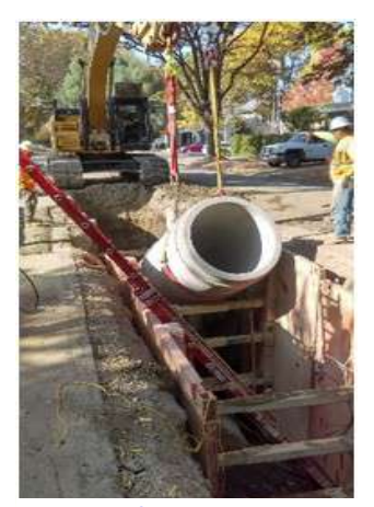
City of Sacramento 3rd Street Project

UNICO's Construction Management Services are built on responsiveness to the needs of our clients and projects, a thorough understanding of the project plans and specifications, and a strong understanding of the Caltrans LAPM, local