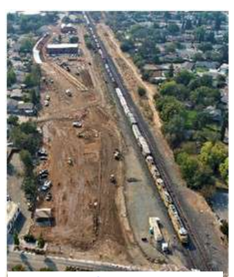
City of Elk Grove Railroad Street and Old Town Plaza

agency standards, Federal-Railroad Administration regulations. UNICO offers construction management, structures representative. bridge, roadway, utility and electrical inspection, constructability reviews, document control and labor compliance.