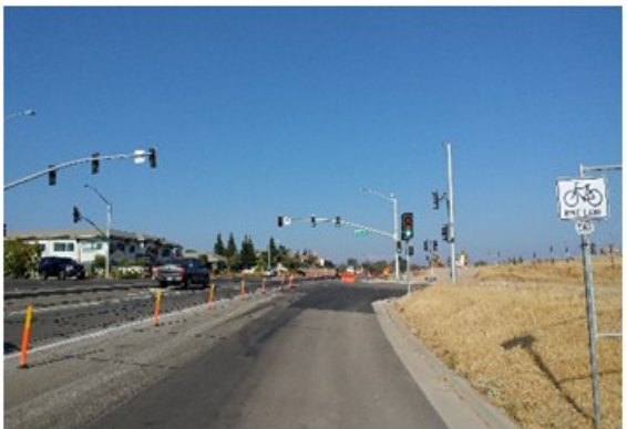
Turn Lane Addition – Sierra College Blvd, Rocklin, CA