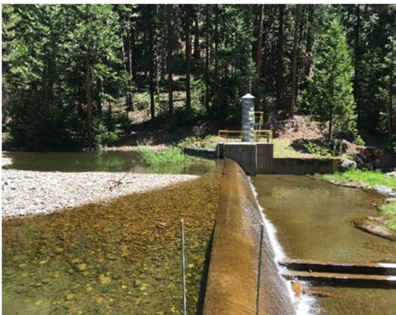
PCWA Sediment Removal Project, Placer County, CA

Our civil engineering services include road design, grading, flood control and drainage, water supply, wastewater, water quality, erosion and sediment control, SWPPPs, parks, schools, trails and utility coordination.