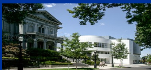
Crocker Art Museum, Sacramento

“Serving Our Clients to Build a Better Community.”