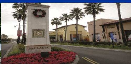
The Palladio, Folsom