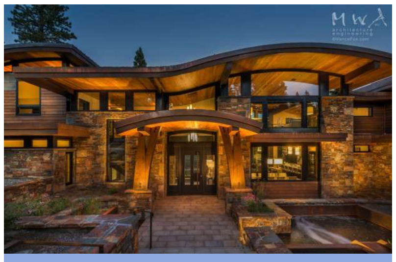
Martis Camp Home - Truckee, CA

MWA, inc. - Architecture and Engineering is a medium sized award winning firm that creates unique custom designs for our client's homes and private commercial projects. We are an experienced firm with youthful energy and a proven track record of client satisfaction with over two thousand projects since our inception in 1985. Our designs range from mountain rustic to traditional to modern to meet our client's needs. Our staff currently holds Architecture, Engineering and Interior Design licensed in California, Nevada and Idaho with most of our projects in and around Truckee and Lake Tahoe. Our firm takes pride in maintaining a professional presence while operating as a casual, down to earth company with a sense of humor. Our office is a fun think tank environment with dogs asleep on the floor and music thumping. We choose to live in the mountains for the high quality of life and our happiness shows in our work.