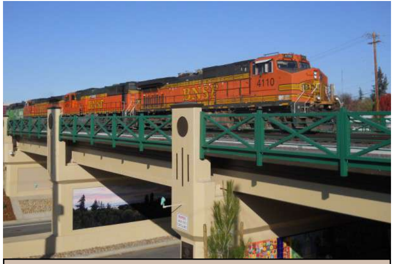
G Street Grade Sep photo: BKF was the civil engineer for the G Street grade separation project that created an underpass for G Street beneath the BNSF railroad in Merced.

BKF's years of experience in diverse markets, combined with new, innovative approaches to problem solving has led to the firm's growth to its current 13 offices with more than 450 experienced staff, and our firm has received awards for design and culture. ENR California named BKF as the 2017 Design Firm of the Year. Additionally, BKF was ranked No. 17 on the 2018 Zweig Group Hot Firm List.