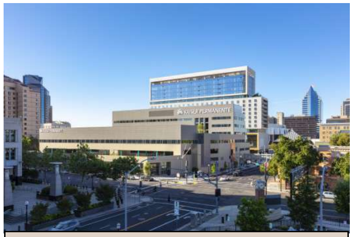
Kaiser Capital Gateway MOB photo: BKF provided civil design for the conversion of existing office building at J Street in Sacramento, CA to a full service medical office building.