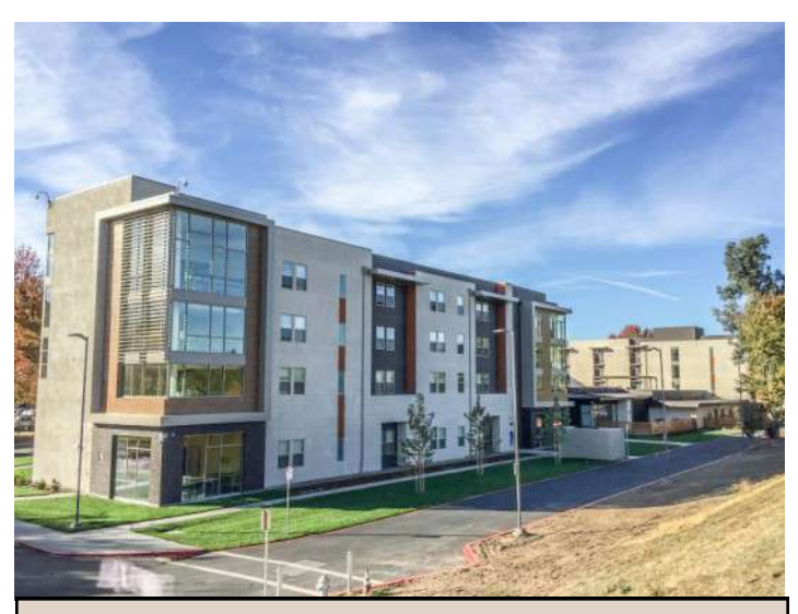
Sacramento State Student Housing photo: BKF was part of the design team for a new 4-story student housing building for Sacramento State University along the American River in Sacramento.

ally, BKF has had a number of projects in Sacramento and Placer counties including medical office buildings, schools, and government facilities. BKF has had an office in Sacramento since 2006. Our headquarters is in Redwood City, and we have offices in Oakland, San Francisco, San Rafael, Santa Rosa, San Jose, Walnut Creek, Pleasanton, Salinas, Richmond, Lathrop, and Newport Beach.