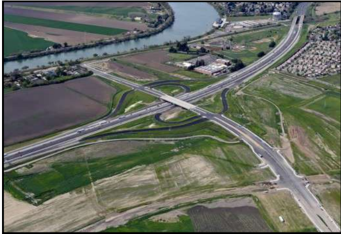
I-5/Cosumnes River Boulevard Interchange and Road Extension, Sacramento