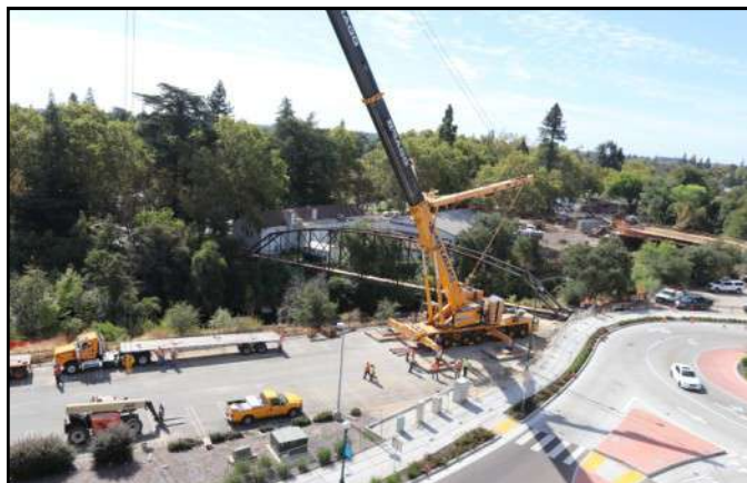
Ice House Bridge Rehabilitation and Relocation, Roseville