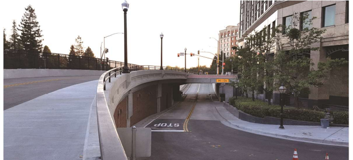
City of Sacramento I-5 Riverfront Reconnection Sacramento, CA

The Riverfront Reconnection reconnects downtown Sacramento over I-5, to the riverfront area known as Old Sacramento. WSP performed the PA&ED and final PS&E on this award-winning project.