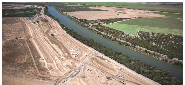
Sacramento Area Flood Control Agency Levee Rehabilitation Sacramento, CA

The Riverfront Reconnection reconnects downtown Sacramento over I-5, to the riverfront area known as Old Sacramento. WSP performed the PA&ED and final PS&E on this award-winning project.