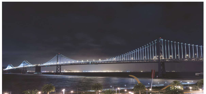
Caltrans San Francisco-Oakland Bay Bridge Bay Lights San Francisco and Oakland, CA

WSP is providing construction management and assessment district services for this major levee rehabilitation program.