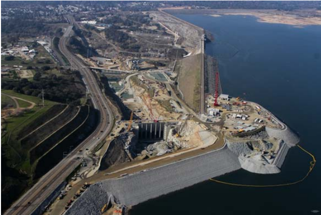
HDR is preparing a new Water Control Manual for the US Army Corps of Engineers, and the Bureau of Reclamation, to more efficiently manage water flows out of Folsom Dam after completion of the new $1 billion auxiliary spillway.