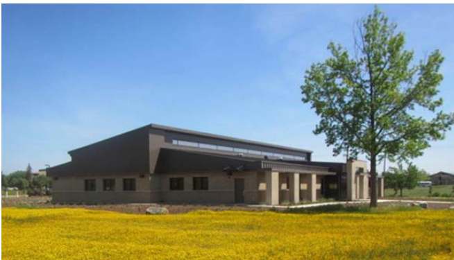
HDR designed the headquarters for the 200th Wing Command of the California Air National Guard at Beale AFB. The 200th Wing provides homeland security and training for worldwide contingency operations in support of active duty Air Force commands.