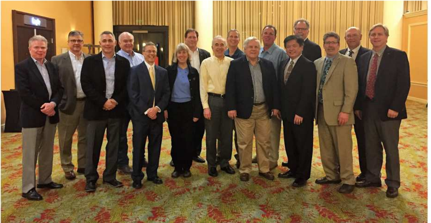
2017 Sierra Chapter Past President's Dinner February 15, 2017