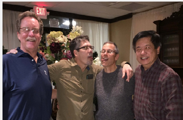
"Best Friends Forever"