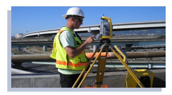
I-580 Bridge Collapse 018

ANDREGG has maintained an excellent reputation for over 70 years by providing unique solutions to client's needs. Every new project is an opportunity to showcase ANDREGG's staff and expertise with the latest technology, real time data management, and exceptional deliverables.