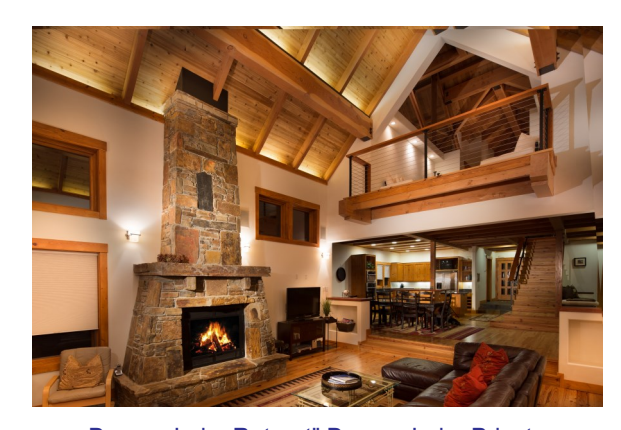
Donner Lake Retreat" Donner Lake Private Residence, Donner, CA

For discerning clientele looking for anything from a sustainable home to an innovative campus, JKAE is the architecture and engineering firm that offers the perfect blend of artistic creativity, technical expertise, passion, and vision for each endeavor, with the expertise to follow through to ensure success.