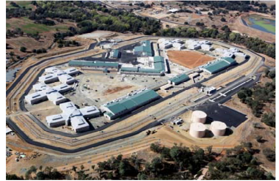
Mule Creek State Prison Expansion Design-Build Project, Ione, California

Learn more about KSN by visiting our website at www.ksninc.com , or visit our Facebook and LinkedIn pages for information on our services and our culture.