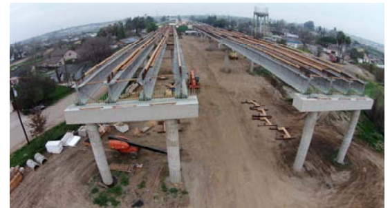
State Route 5 Crosstown Freeway Extension Project, Stockton, California