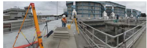
Silicon Valley Clean Water WWTP Outfall Replacement Project, Redwood City, California