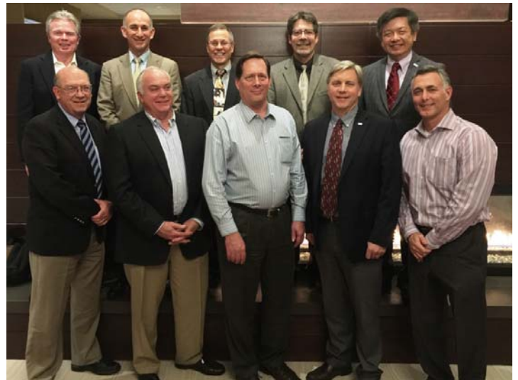
2016 Sierra Chapter Past Presidents Dinner Attendees