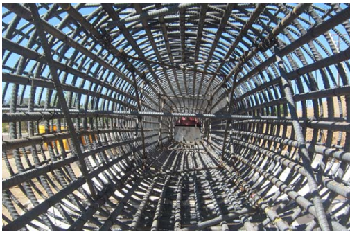
East Bypass Project in Sonora, CA

Alta Vista Solutions (Alta Vista) is a client-based engineering firm that focuses on solving problems to keep projects moving forward.