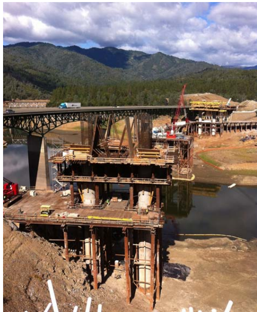
Antlers Bridge Project, Lakehead, CA

Alta Vista has earned an extraordinary reputation of offering solutions to some of the world’s largest infrastructure projects. We are known for ‘doing right’ by our clients, team members, and all project stakeholders.